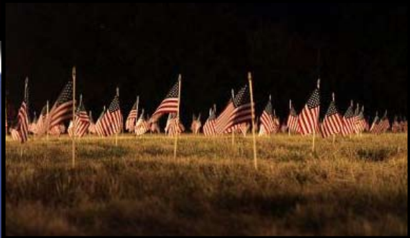
Sherman Fire Protection District 9/11 Memorial