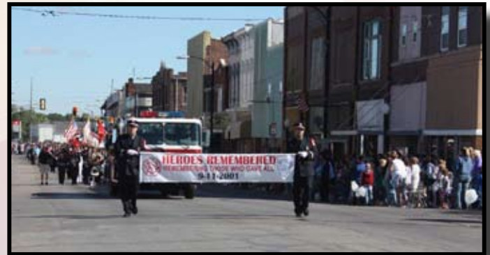
Pana 2011 Labor Day Parade.

During a station dedication and tribute event to the 10th Anniversary of 9-11, Huntley FPD personnel are pictured with a piece of steel they received from the World Trade Center.